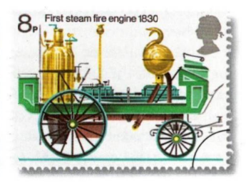
Fire Service issue Early sketches featured fire engine components like the nozzle of the power hose. Fire engines from different periods over the 200 year span were developed as artwork for approval.

Who decides the theme? Speaking on the choice of theme Gentleman said, '...stamps never begin with a designer seeing something pretty and thinking: that would make a good stamp...A new issue usually starts with an idea for a theme, perhaps (from) within the Post Office, or by a member of the public or by a public institution which would like its own stamp.'5